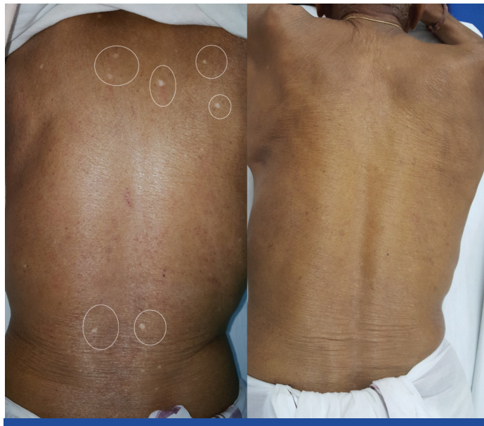
[Table/Fig-3]: Pretreatment and postreatment photo of group PP.