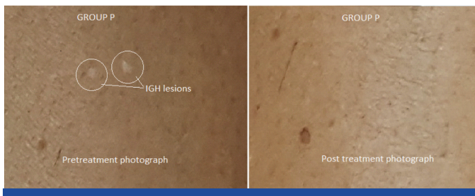
[Table/Fig-2]: Pretreatment & postreatment photograph of group P.